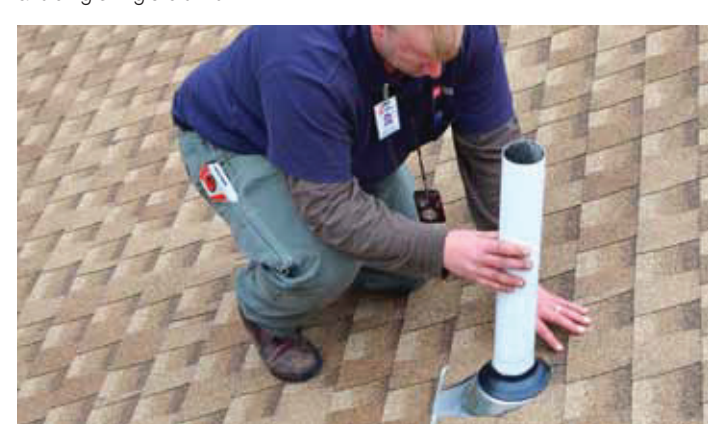
Ensuring flashings are installed properly to protect the roof deck and living space from water damage.