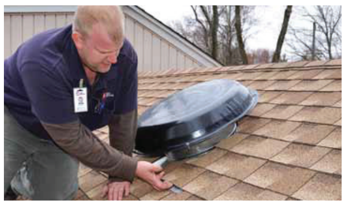
Ensuring attic ventilaton and accessories are installed properly to maximize performance and prevent future leaks