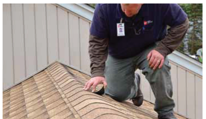
Ensuring ridge cap shingles are fastened properly and to the correct exposure, avoiding shingle blow-off.